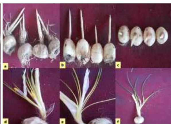
Fig. 4. Effect of corm weight on number of flowers/sprout and sprout width (cm). a) >10g corm weight showing profuse activation from apical and axillary buds. b) 8-10g corm showing activation from apical region. c) <8g corm showing slow sprout growth. d) >10g corm showing 3 flowers/spathe with 2.7 cm sprout width. e) 8-10g corm showing 1 flower/spathe with 2.1 cm sprout width. f) <8g corm showing no flowers/spathe with 1.2 cm sprout width.