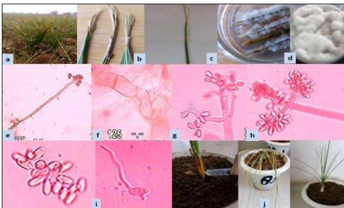
Fig. 8. a) Field view of R. solani affected plants. b) Diseased leaves. c) R. solani lesions on leaf. d) R. solani isolates on agar sucrose medium. e) Microscopic view of mycelium of R. solani . f) Monilioid cells of R. solani . g) Mycelium at early stage. h) Mycelium at maturity with branches at right angles bearing spores. i) Bsidiospores. j) Pathogenicity test.