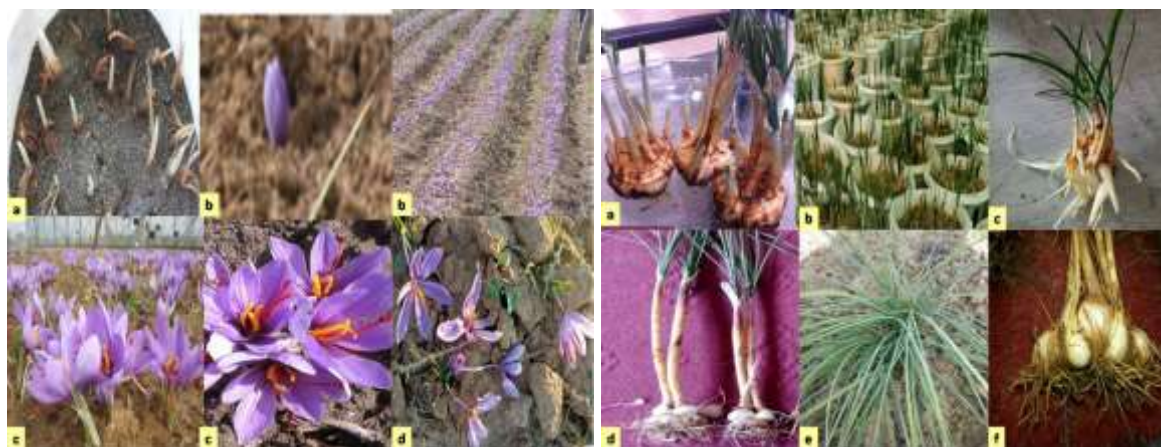
Fig. 5. Flowering phase (R). a) Emergence shoots (cataphylls) breaking through soil surface. Flower cataphylls are visible aboveground, enveloped by its bracts. Flower cataphylls still closed (R1). b) Blooming (unopened flowers with floral organs enclosed by tepals (R2). c) Anthesis (Opened tepals with visible stigma and anthers. (R3). d) Flower senescence (when the tepals dehydrate and fall on the ground) (R4).