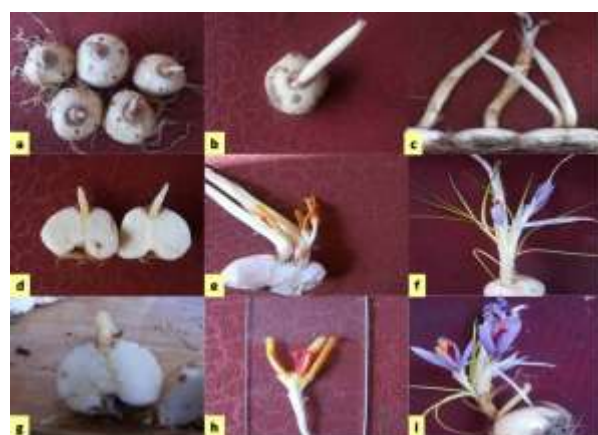
Fig. 3. Bud sprouting (BS). a) Sprout initiation and fibrous root development (BS). b) Sprout length reaches to 4 cm length (BS.1). c) Sprout length reaches to 12 cm (BS.2). d, g) Longitudinal section showing floral initials in vascular bundles (BS). e, h) Longitudinal section showing floral parts in sprout. (BS.1). f, i) Sprout length reaches to 13 cm and longitudinal section showing complete floral parts embedded in whorl of tepals (BS.3).