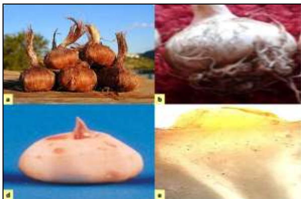
Fig. 1. Corm Dormancy Phase (S0). a) corms with tunic. b) Dormant corms with mother corm residue. c) Naked corm showing dormant meristematic regions. d) The apex of dormant corm looks like a resting bud with protective cataphylls.

Vegetative stage is most critical as chilling requirement for vernalization is received during 66 days (11 th November to 15 th February). The period is critical for development of replacement corms which largely depends on efficient translocation of photosynthates from source to sink. Phenological growth stage is completed with plant senescence with production of full mature corms showing impression of mother corms (Salwee & Nehvi, 2018a). A staging system for development saffron that relies on simple, visual, non-destructive criteria was proposed to allow for quick determination of development stage. This system can be used by both farmers and for experimental trials. Phenological growth stages of saffron have also been reported by Horacio Lopez-Corcoles et al. (2015).