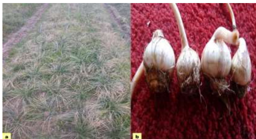
Fig. 7. Plant senescence (R). a) Leaves show signs of prominent senescence (VE.5). b) Development of fully mature daughter corms (VE.5-1).