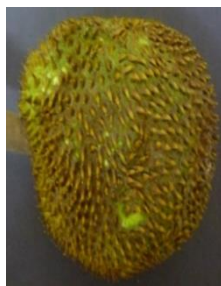
Fig. 1d. Ripe fruit with brown skin, soft flesh and mature seeds