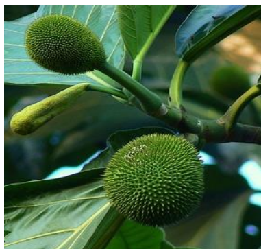
Fig. 1a. Breadnut flower and immature fruits