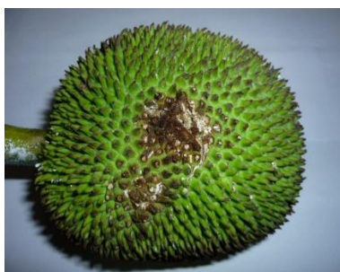
Fig. 1f. Physical damage