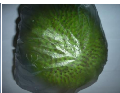
Fig. 1g. MAP of mature fruit