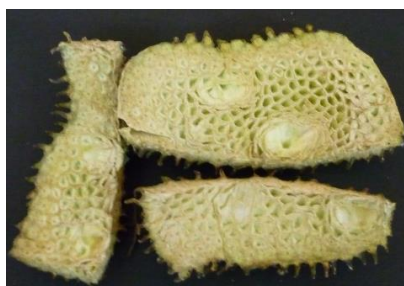
Fig. 1e. Enzymatic browning of flesh