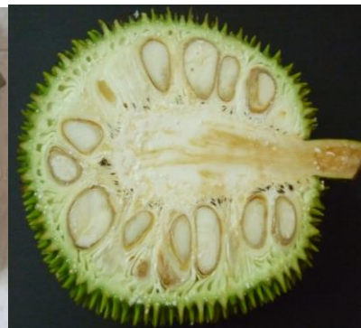
Fig. 1c. Internal section of mature fruit