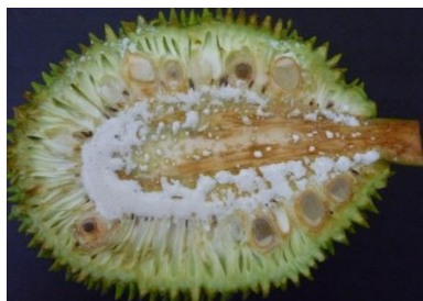
Fig. 1i. Chilling injury (CI)