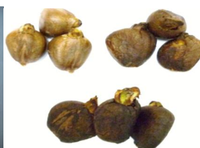
Fig. 1h. Seed testa color changes