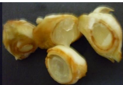
Fig. 1j. CI seed translucency