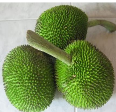
Fig. 1b. Mature breadnut