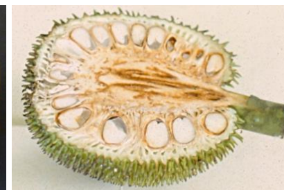
Fig. 1k. CI seed discoloration